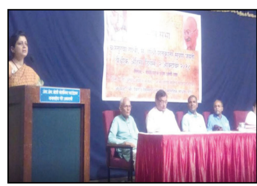
Dignitaries at the Gandhi memorial lecture.